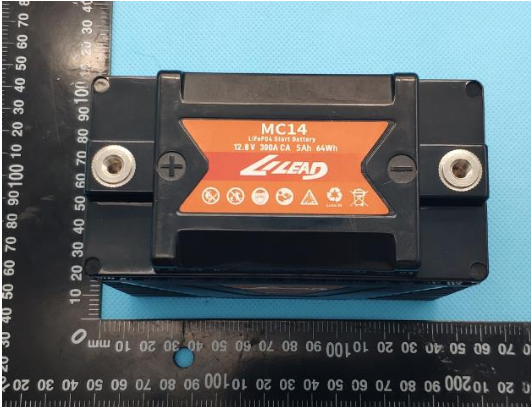
Samples /样品 (MC14 12.8V 5Ah 64Wh)